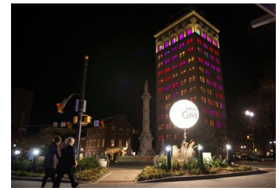
Lancaster's Greist Building "Lit Up The Night" to celebrate the end of 24 hour day of giving.

View. All donor generosity continues to provide the Benevolent Care Fund for those whose assets are insufficient to provide lifelong care during their stay at Pleasant View. Residents and Staff paused to say, "I Gave", for this very worthy cause.